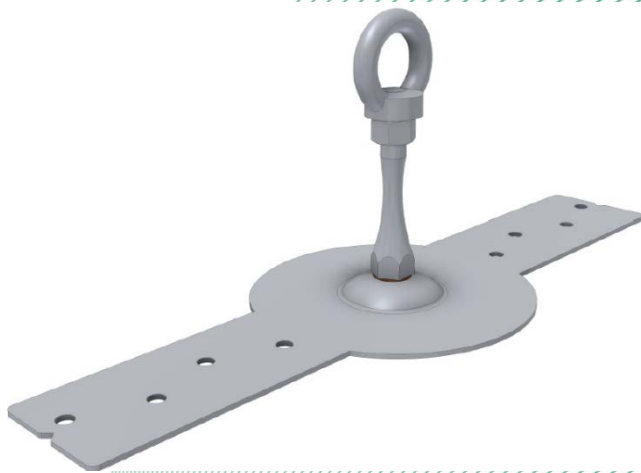
Fig. 1: Anchor device type: LUX-top® DUO III

At the upper end of the support, there is a ring eyelet securely screw-fastened to which the user connects his PPE using his connector to protect himself against falls from a height.